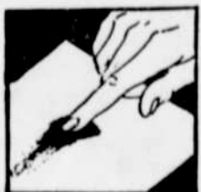
Not only does Shell Motor Oil form 2/3 less carbon—the little it does form is soft, soot-like, a kind that blows easily away.

You've probably seen mechanics working on one of the older type motors—scraping layers of carbon off the piston heads—a big handful of it from one motor!