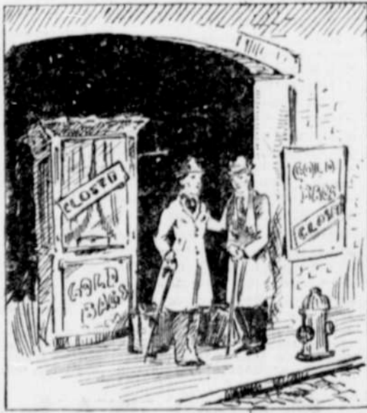
The first show in which they played together was "The Gold Bag," in 1898. It closed a flat failure. But this did not discourage them.