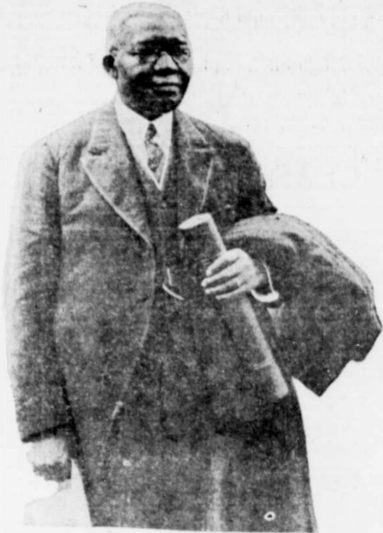
THIS photograph shows Robert Russa Moton, upon whom the degree of master of arts was conferred by Harvard, Thursday, June 20. The following words by President A. Lawrence Lowell preceded the conferring of this degree, "Robert Russa Moton, worthy successor of a great educator of his race—a man whose courage and sagacity have triumphed over perils to his school." Harvard conferred an honorary degree on the late Booker T. Washington also.