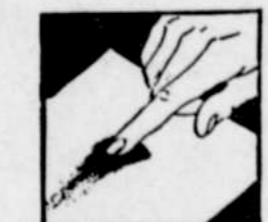
Not only does Shell Motor Oil form 2/3 less carbon—the little it does form is soft, soot-like, a kind that blows easily away

You've probably seen mechanics working on one of the older type motors—scraping layers of carbon off the piston heads—a big handful of it from one motor! But the newer engines could never stand such carbon deposits. Some of them have only the thickness of a knife blade between piston and cylinder head—no room at all for carbon.