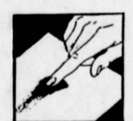
Not only does Shell Motor Oil form 2/3 less carbon—the little it does form is soft, soot-like, a kind that blows easily away

You've probably seen mechanics working on one of the older type motors—scrapping away carbon off the piston heads—a big handful of it from one motor! But the newer engines could never stand such carbon deposits. Some of them have only the thickness of a knife blade between piston and cylinder head—no room at all for carbon. What causes carbon? The carbon that builds up in your motor comes from burned oil. And it is a strange fact that often the highest priced lubricants will give you large quantities of gritty, hard carbon. In spite of all this it is easy now to avoid carbon-forming oils. For science has perfected one oil that is little soot. Only a little soot Shell Motor Oil, the result of a new refining process, forms less than one-third the carbon of even the costliest oils; no hard carbon, only a little soot that blows easily away through the exhaust. Its lubricant value is far greater than old type oils. Careful refining leaves all its "body" intact ready to resist even the most violent changes in temperature. Insist on Shell Motor Oil every time you buy. It is almost a necessity in today's motors.