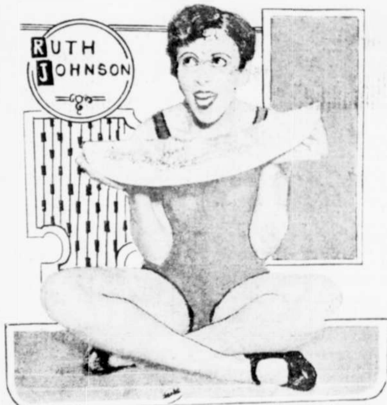
This young lady is the champion watermelon eater of all times. At one sitting she ate three whole watermelons in one hour and a half. The season of the year for her to defend her title has almost arrived. She should have plenty of competition.