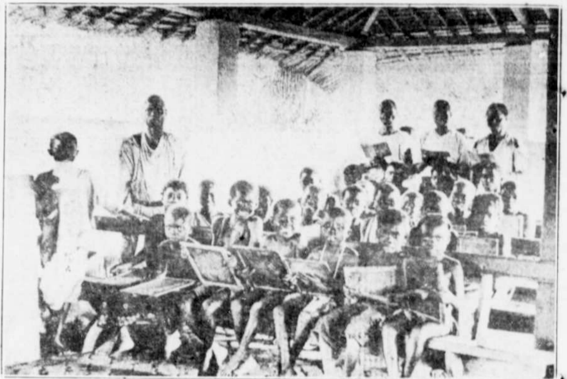
There are a lot of smiles on this photo, taken in the Belgian Congo, Africa, showing young natives about to enjoy a lesson in "writin'."