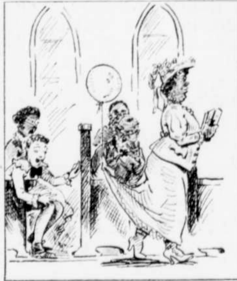
2. He possessed an extraordinary sense of humor, far beyond his years, and often shocked the members of his family, when he displayed in church, antics that offended the deacons and deaconesses.