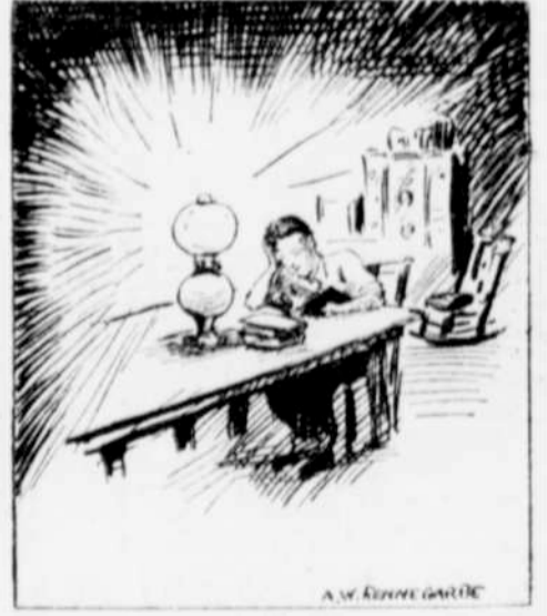
4. His taste for books and academic study rapidly developed, and while here he often studied late at night in the hope that his would be admitted to Leland-Stanford University. But he was never financially able to realize his dream.