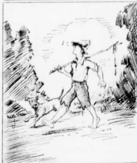
1. When he reached the Boy Scout age he was fond of tramping alone, climbing the hills, fishing and indulging all his naturalist instincts.