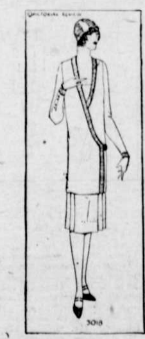
SURPLICE CLOSING FEATURED

Smartness and severity are synonymous terms in the lexicon of fashion, and both are eloquently interpreted in this model in natural color kasha cloth trimmed with novelty braid whose color scheme combines black, red, and old blue. The blouse closes in surplice fashion, being worn with a skirt that is plaited in front and plain in back. Medium size requires 4½ yards novelty braid. Pictorial Review Printed Pattern No. 3018. Sizes, 34 to 44 inches bust, 45 cents.