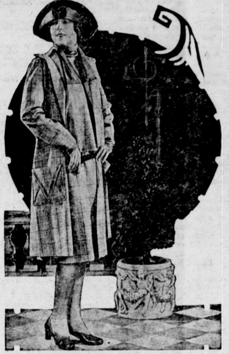
ENSEMBLE THAT MAKES APPEAL

Even the new felts declare mutiny in the ranks when it comes to featur-A striking autumn compose suit is ing the simple banded types. The two shown in the picture: One can readily felt models shown at the top of the appreciate that such an ensemble will accompanying group tell a story of give splendid service. As to smart greater elaboration, Felts of larger