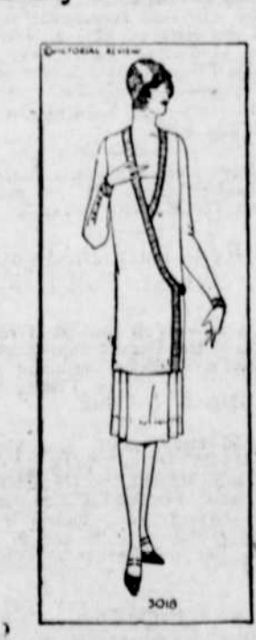
SURPLICE CLOSING FEATURED

Smartness and severity are synony-mous terms in the lexicon of fashion, and both are eloquently interpreted in this model in natural color kasha cloth trimmed with novelty braid whose color scheme combines black, red, and old blue. The blouse closes in surplice fashion being worn with in surplice fashion, being worn with a skirt that is plaited in front and plain in back. Medium size requires 434 yards 40-inch material and 234