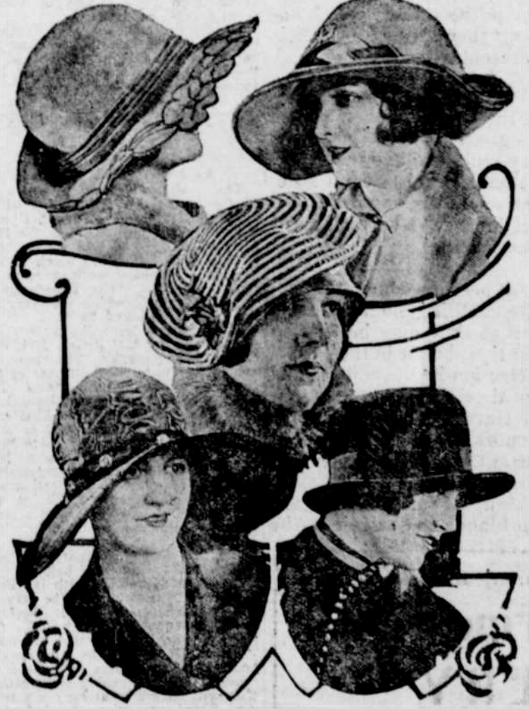
ELABORATE MILLINERY DESIGNS

stripes of gray and black worn with centered in the picture is an ade cont of gray. There is no end to the novelty woolens which combine effectively