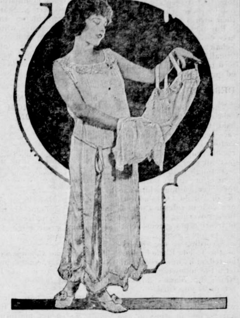
A CREPE DE CHINE SET

The holiday rush being over, comes now a period of home-sewing and midseason bargain sales. It is a summons to clothes preparedness. In entering upon one's spring and summer wardrobe campaign fancy turns first to dainty lingerie—for every woman of fashion dotes on pretty underthings. Now that the economy of silk for underwear is an established fact, exquisitely colorful crepe de chine, crepe satin, also georgette, have be-