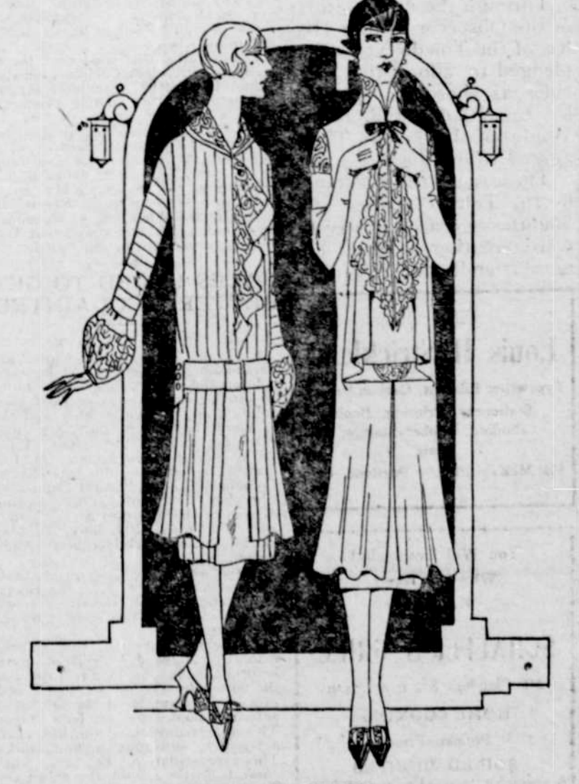
TWO PARIS MODELS

come as staple almost as muslin, long cloth and similar white goods once were. There is, however, considerable use of sheer daintily tinted cotton voile, likewise printed voiles and cottons for pajama outfits and nightgowns. Outstanding features which have to do with newest lingerie stress the following: Widened hemlines secured by godets of the material of which the garment is made or with triangular insets of lace; most everything made up in match sets; garments either strictly tailored or else very lacy abounding in much elaboration. Color continues an interesting theme. Flesh, peach, rose, lavender, with a growing favor for maize and light blue are noted, and the preference for white is expressed. Crepe de chine sets like the one in the picture may be made or bought. An unusual use of two kinds of lace marks this gown and matching combination. Real Irish crochet forms the yoke of the gown, also the band of the combination, with Valenciennes