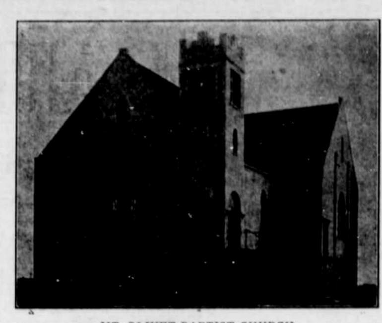
MT. OLIVET BAPTIST CHURCH East 1st and Schuyler Sts. Rev. E. C. Dyer, Pastor. Res. 1876 Foster Street. Phones: Res. Walnut 0425; Study, East 3333

WET WASH 2 IN 1 WASH 507 E. Flanders, Portland, Oregon