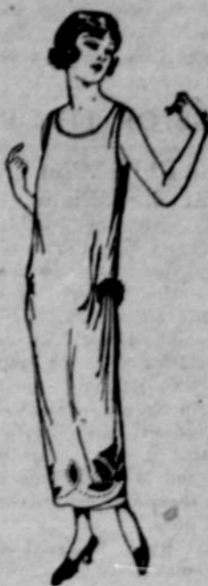
MODISH BLACK SATIN

To go through the season without a formal frock of black satin or crepe is simply out of the question. Simple and generally becoming is this model which may have either a round or V-shaped neck back and front. The front of the dress is laid in plaits on the shoulders, the back and the right side of the front being gathered. Embroidery appliqué ornaments the rounded lower edge. Medium size requires 3 1/4 yards 36-inch material. *Fictorial Review Dress No. 2151. Sizes, 34 to 46 inches bust. Price, 45 cents. Embroidery No. 12901. Transfer, blue or yellow, 40 cents.