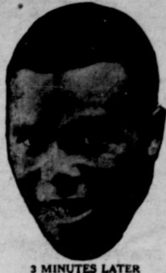
3 MINUTES LATER