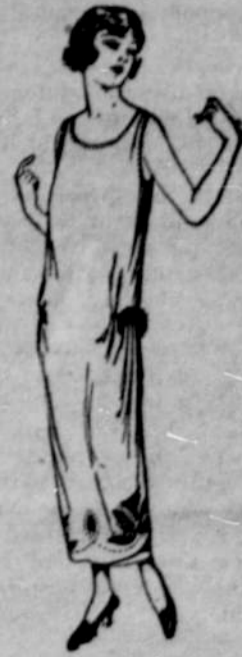
MODISH BLACK SATIN

To go through the season without a formal frock of black satin or crepe is simply out of the question. Simple and generally becoming is this model which may have either a round or V-shaped neck back and front. The front of the dress is laid in plaits on the shoulders, the back and the right side of the front being gathered. Embroidery appliqué ornaments the rounded lower edge. Medium size requires 3 1/2 yards 36-inch material. * Pictorial Review Dress No. 2151. Sizes, 34 to 46 inches bust. Price, 45 cents. Embroidery No. 12901. Transfer, blue or yellow, 40 cents.