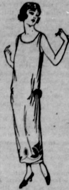
MODISH BLACK SATIN

To go through the season without a formal frock of black satin or crepe is simply out of the question. Simple and generally becoming is this model which may have either a round or V-shaped neck back and front. The front of the dress is laid in plaits on the shoulders, the back and the right side of the front being gathered. Embroidery applique ornaments the rounded lower edge. Medium size requires 3 1/2 yards 36-inch material. Pictorial Review Dress No. 2151. Sizes, 34 to 46 inches bust. Price, 45 cents. Embroidery No. 12901. Transfer, blue or yellow, 40 cents.