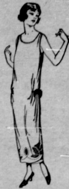
MODISH BLACK SATIN

To go through the season without a formal frock of black satin or crepe is simply out of the question. Simple and generally becoming is this model which may have either a round or V-shaped neck back and front. The front of the dress is laid in plaits on the shoulders, the back and the right side of the front being gathered. Embroidery appliqué ornaments the rounded lower edge. Medium size requires 3 1/2 yards 36-inch material. *Fictorial Review Dress No. 2151. Sizes, 34 to 46 inches bust. Price, 45 cents. Embroidery No. 12901. Transfer, blue or yellow, 40 cents.