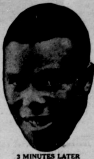
3 MINUTES LATER