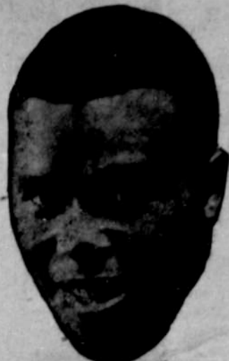
3 MINUTES LATER