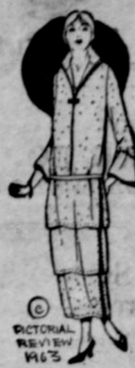
PICTORIAL REVIEW DRESS NO. 1963