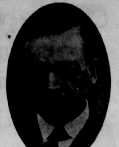
Charles McNary, United States Senator from Oregon, who defeated Mayor Geo. L. Baker for the nomination at the primary election by a vote of more than two-to-one.