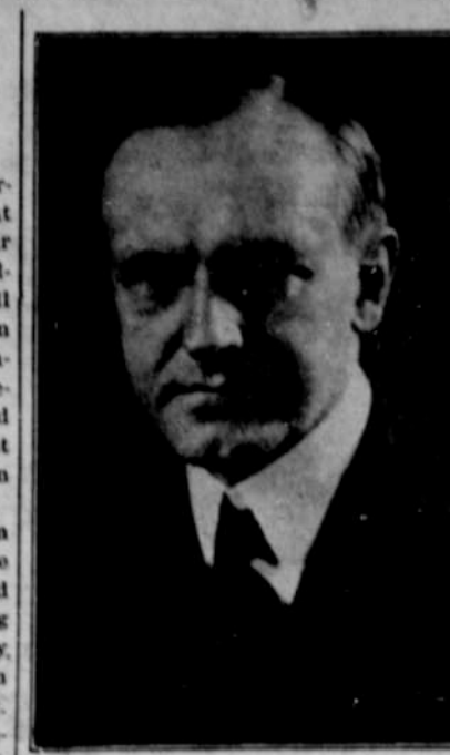
Charles McNary, United States Senator from Oregon, who defeated Mayor Geo. L. Baker for the nomination at the primary election by a vote of more than two-to-one.

President Calvin Coolidge, who is the choice of Oregon voters for the presidential nomination, evidenced at the polls May 16th.