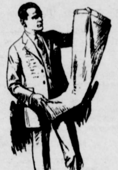
THIS WEEK ONLY