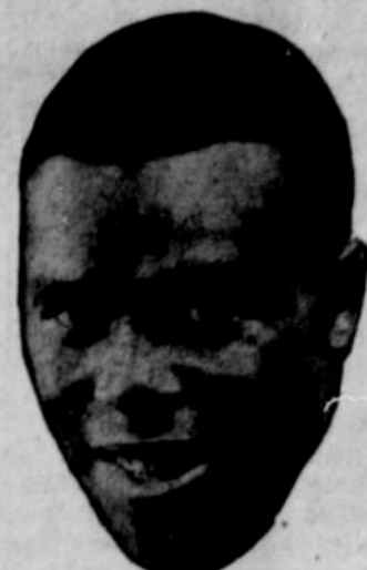
3 MINUTES LATER