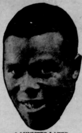
3 MINUTES LATER