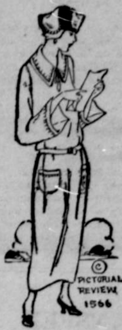
FROCK OF SMART STYLE

For practical as well as fashionable wear, one could not do better than select this dress of dark blue rep, which seems to be even more favored than the twillcoats. Finishing the V-shaped neck is a collar of self-material stitched with silver and turquoise blue embroidery. The pockets and sleeves are decorated to correspond with the collar. If desired, circular panels may be added to the sides of the skirt. As pictured the dress requires 2 3/4 yards 54-inch material.