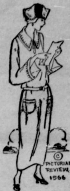
FROCK OF SMART STYLE

For practical as well as fashionable wear, one could not do better than select this dress of dark blue rep, which seems to be even more favored than the twillcoats. Finishing the V-shaped neck is a collar of self-material stitched with silver and turquoise blue embroidery. The pockets and sleeves are decorated to correspond with the collar. If desired, circular panels may be added to the sides of the skirt. As pictured the dress requires 2 3/4 yards 54-inch material. Pictorial Review Dress No. 1566. Sizes, 34 to 48 inches bust. Price, 35 cents.