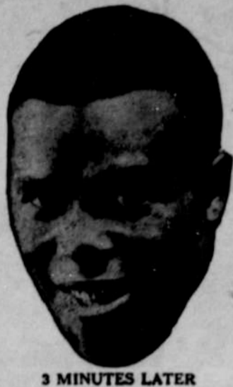
3 MINUTES LATER