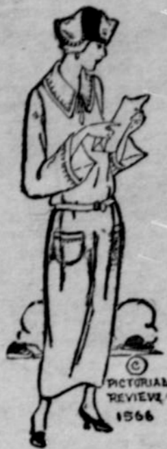
FROCK OF SMART STYLE

For practical as well as fashionable wear, one could not do better than select this dress of dark blue rep, which seems to be even more favored than the twillcoats. Finishing the V-shaped neck is a collar of self-material stitched with silver and turquoise blue embroidery. The pockets and sleeves are decorated to correspond with the collar. If desired, circular panels may be added to the sides of the skirt. As pictured the dress requires 2 3/4 yards 54-inch material. Pictorial Review Dress No. 1566. Sizes, 34 to 48 inches bust. Price, 35 cents.