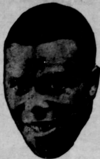
3 MINUTES LATER