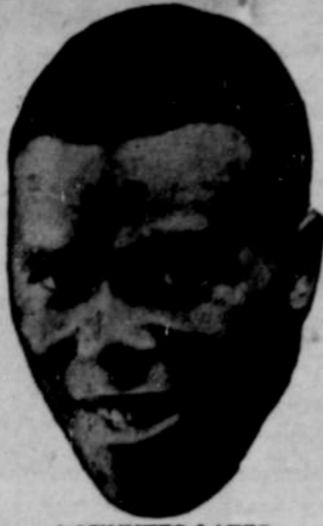
3 MINUTES LATER