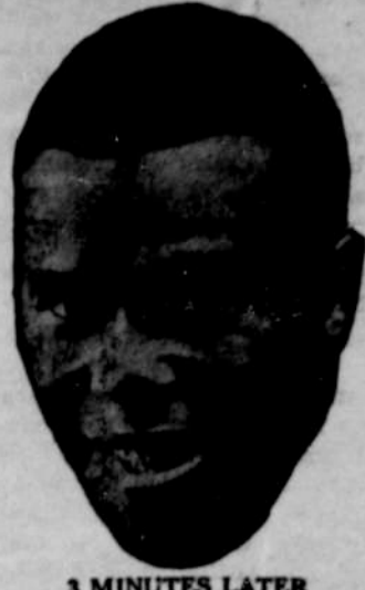
3 MINUTES LATER