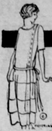
IN NAVY TAFFETA

Pert in its simplicity is this frock of navy blue taffeta, which fastens at the left side and affords a splendid chance to use as a trimming some of the button novelties in such great vogue this season. If desired, the bands on the skirt may be omitted, but they are a smart way of breaking the monotony of the straight silhouette. The sleeves may be worn long or short, as fancy dictates. Medium size requires 4 3/4 yards 36-inch taffeta. Pictorial Review Dress No. 1646. Sizes, 34 to 44 inches bust and 16 to 20 years. Price, 35 cents.