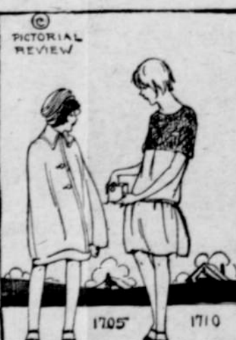
FOR THE STYLISH YOUNG

Wraps of an enveloping character are still among Fashion's favorites, and they give a charming finishing touch to the toilette of the stylish young. First, is pictured a cape in navy blue rep with a collar that may be closed at the neck or rolled low. The fronts of the cape are slashed to slip the arms through. The gray chevrons, checked tweeds, and twill-cords are also appropriate for this natty little garment. Eight-year size requires 1 3/4 yard 54-inch material, with 2 3/4 yards 36-inch lining. The slip-on dress to the right may be worn under the cape, or with a coat. It closes at the center-back, the front and back being joined to a yoke of lace which is cut in one with the sleeves. The dress is also slashed in from the under-arm seams and the lower slashed edges gathered. If preferred, the sleeves may be lengthened with deep sections of self-material. Medium size requires 2 3/4 yards 36-inch material, with 3/4 yard all-over lace.