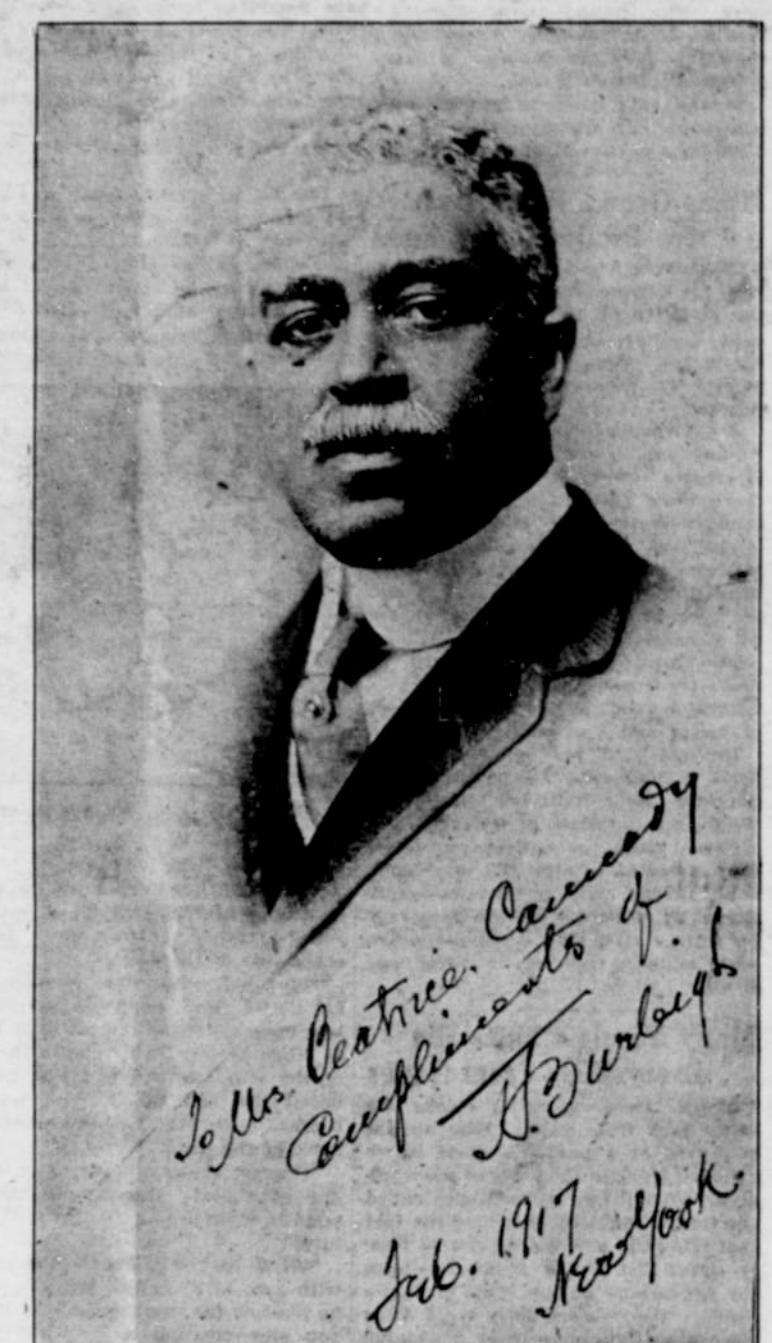
HARRY T. BURLEIGH