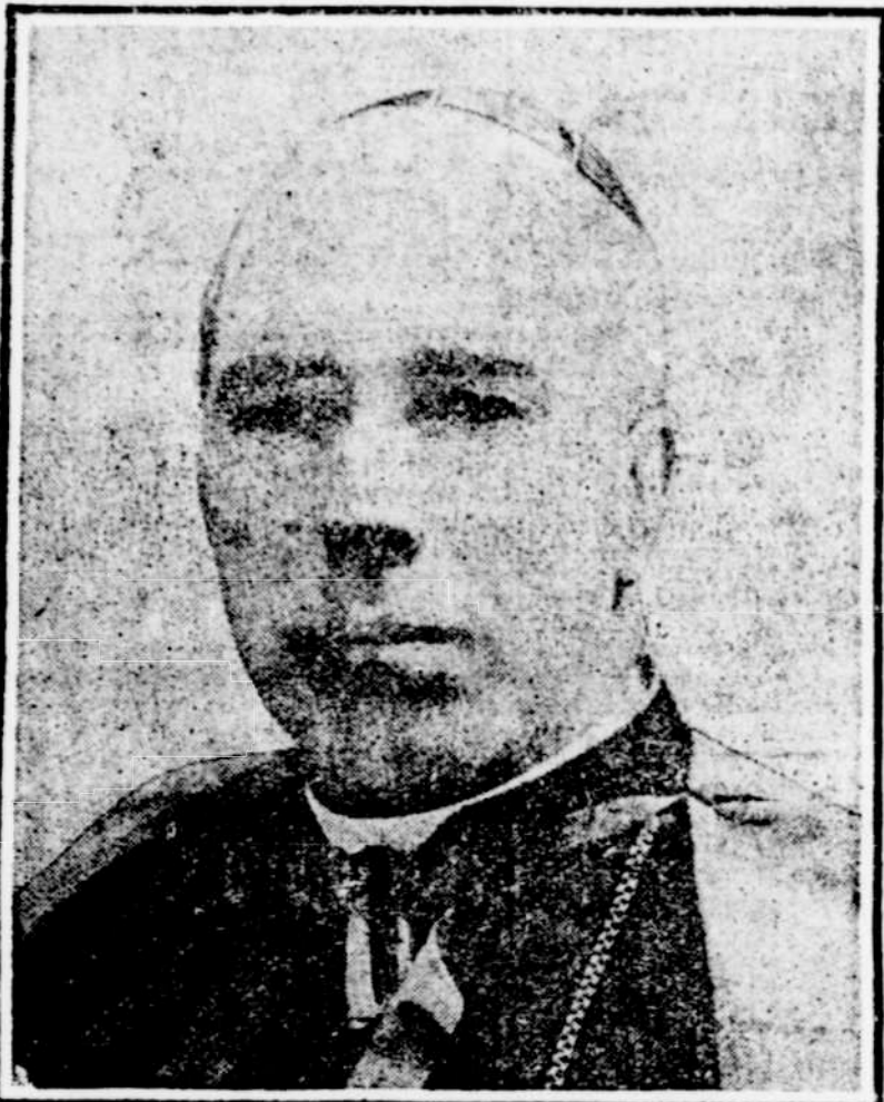
CARDINAL MICHAEL LOGUE.

Apprentices wanted to learn type setting. We can use three bright boys or girls able to read and punctuate plain English. Work all or part of the time, with prospect of a trade and steady work, here or elsewhere, later on. Apply immediately at the Chronicle office.