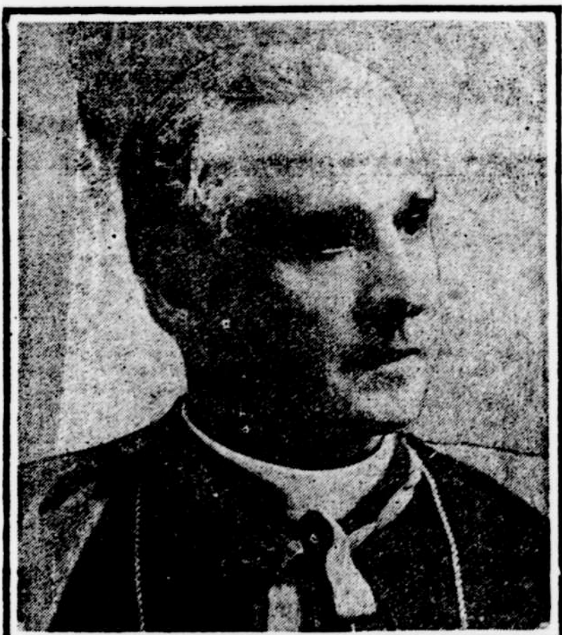
ARCHBISHOP FARLEY OF NEW YORK.

Among the distinguished visitors at the Catholic centennial in New York city was Cardinal Logue of Ireland, who came to America expressly to attend the celebration. The cardinal is archbishop of Armagh and primate of all Ireland. He is a man of most engaging personality and a brilliant orator. On the occasion of his departure from Ireland he said he was going to America to carry greetings to the native sons of the Emerald Isle who were in exile in the new world.