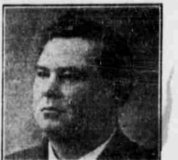
JUDGE SAMUEL T. RICHARDSON Candidate for JUSTICE SUPREME COURT Republican Primary Election, May 15, 1914

brought out before the grand jury later developed to justify this action. The next jury case will be the civil action of the Willis Furniture Company vs. the Horticultural Fire Relief of Oregon. It is stated that the only remaining criminal trial is the matter of the State vs. J. L. Freeman, but owing to the many other actions it is believed that this term of court will continue until after the first of next month.