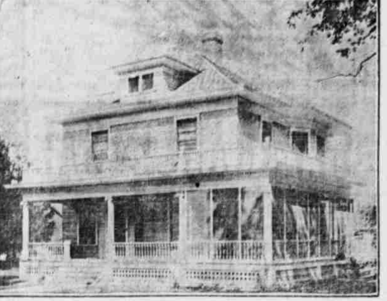
PERSPECTIVE VIEW—FROM A PHOTOGRAPH.

Design 927, by Glenn L. Saxton, Architect.