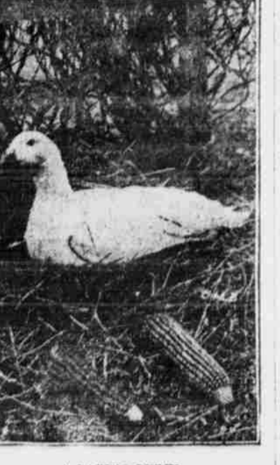
A LAYING PEKIN.

Uncle Pete says, "Keep a duck for luck." There's this true, sure—if you don't want eggs laid on the hen installment plan, keep Pekin, Runner or Orpington quacks for when they start to lay in March or February. 100 eggs straight ahead is no unusual record. They naturally lay at night, and if on the pond you may duck for eggs next morning, a New York farmer who drained his pond to catch egg-eating 500 ducks eggs in the bottom. When incubated nearly all hatched, as duck eggs are very fertile. If you wish a duck to sit soon, don't remove eggs from nest unless too many accumulate. She builds her nest gradually by adding sticks, straws and