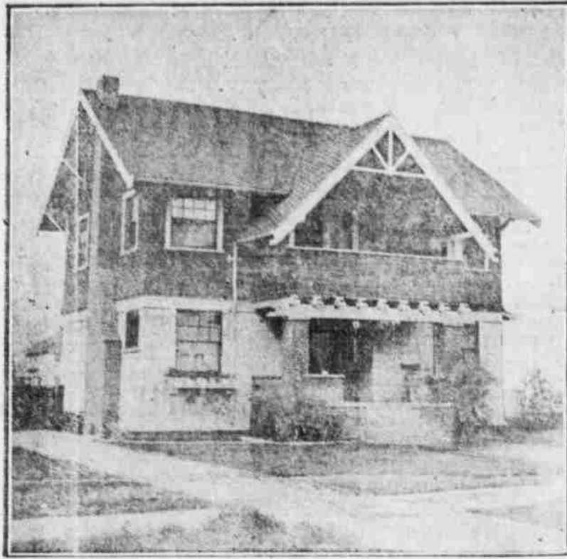
PERSPECTIVE VIEW—FROM A PHOTOGRAPH.

Design 865, by Glenn L. Saxton, Architect.