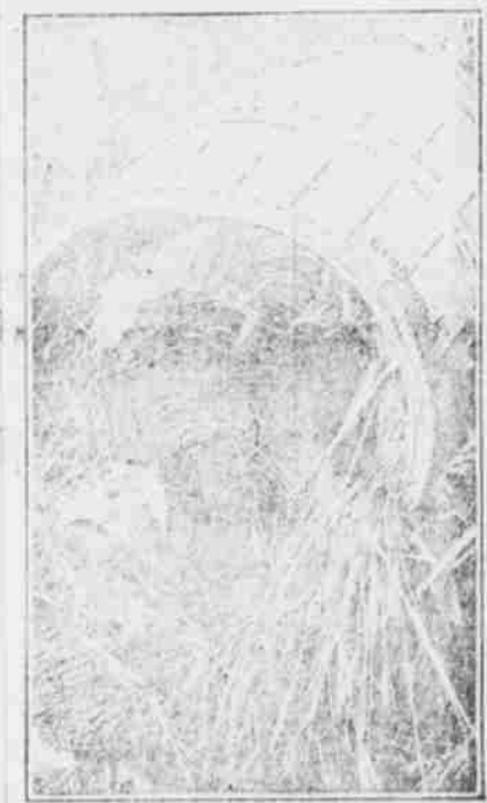
THE OLD OAKEN BARREL.

Face the nest south, keep the eggs from getting chilled and date them as nearly all hatch, and the quick growing poult must be well covered.