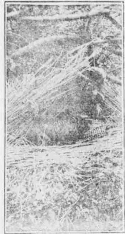
IN NATURE'S WAY.

Then's the time for you to get busy making nests in quiet cozy corners, for your turkey hens are due to lay. But don't forget those trilling beauties are from wild ancestry and love