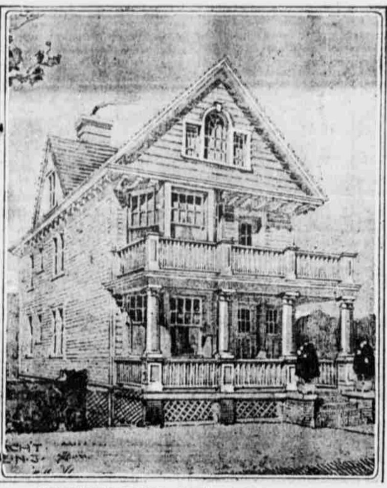
PERSPECTIVE VIEW-FROM A PHOTOGRAPH

A Two Family Suburban House. Arranged in the Style of the Flat - Estimated Cost, $4,200. Copyright, 1909, by F. G. Lippert, East Orange, N. J.