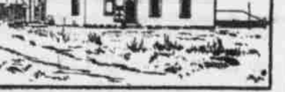
FIG. XXXIII—FARM HOME BARE AND DESTITUTE FROM LACK OF TREES, SHRUBS AND LAWN.

The starting point is the cellar. With but little additional expense this can be made the full size of the house. In this case the foundation walls should extend to the bottom of the cellar.