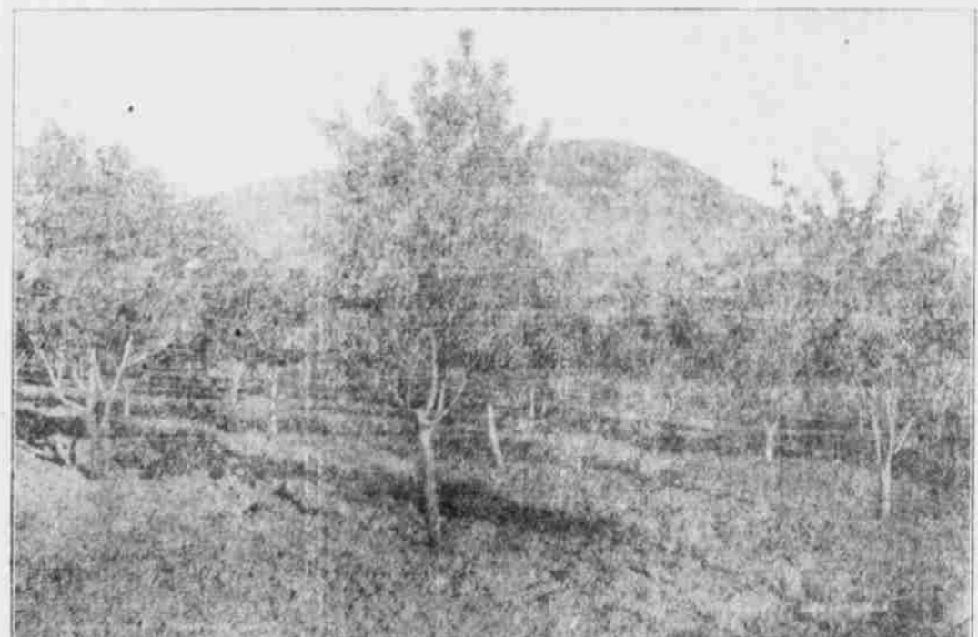
Improved Lands at Lakeside.