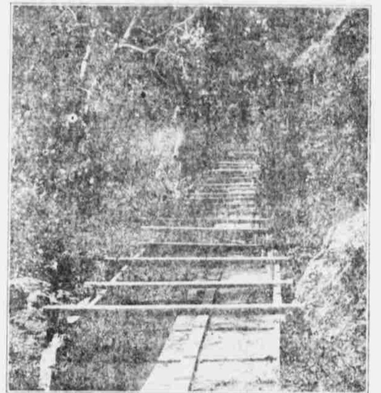
Month of our 1-mile drive, now in use at Lakeside

ever yearned for your own little home, where you could be your own master; grow what you think you could make the most money from; breathe the pure air and enjoy to the fullest extent the profits of your own labor? Has the matter been presented to you in such a manner that you could accomplish this result? If your heart is filled with the desire to be one of those favored men—a fruit-grower, in a real fruit belt, where Nature, soil, water, and climate, combine to produce this result, read every word of this message that is meant to bring you a scent of freedom apart from the daily grind and toil of working for others. We tell these things to you because we believe we have the opportunity that you have longed for and never found UNTIL NOW.