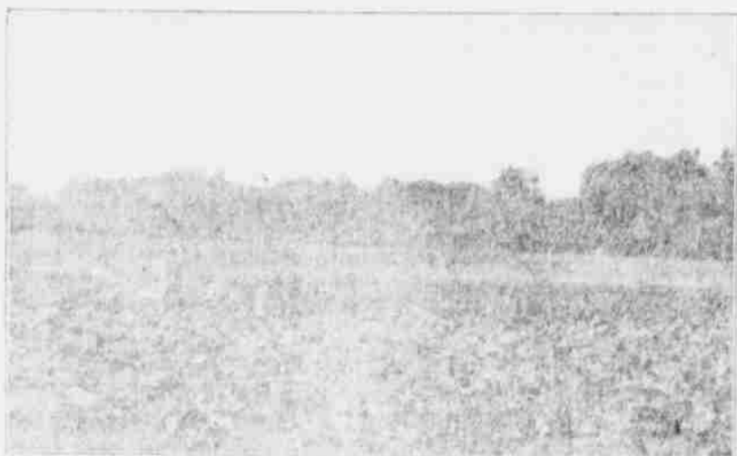
The majestic Cannon Ranch, Lakeside, California.

The railroad line between Alturas and LAKESIDE, California, is now under way, ties and rails being laid part of the way to our new town. These tracts will DOUBLE IN VALUE when the first train arrives.