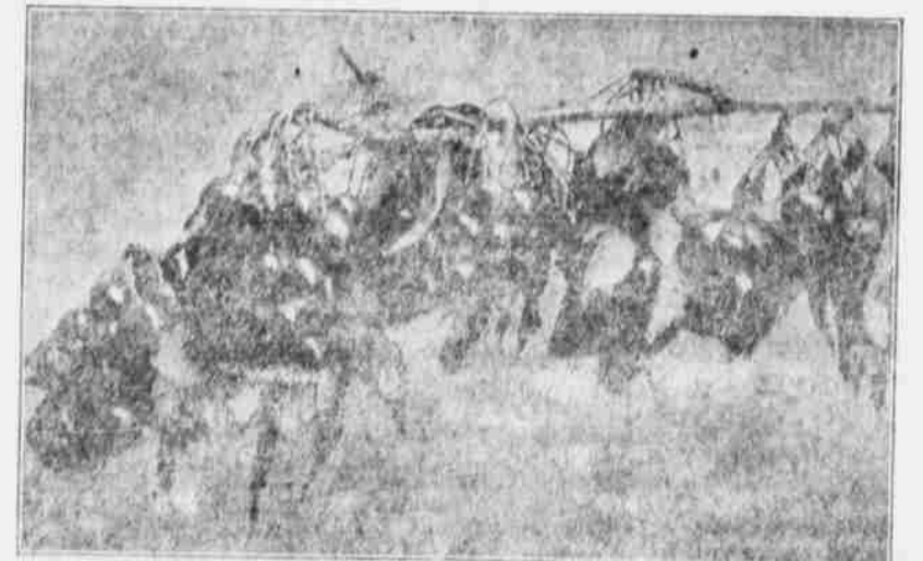
Lambert Cherries, grown at Lakeside, California.

LAND that grows Big Red Apples , with the most perfect blending of colors ever seen. Apples such as won the $1,000 Prize at the Alaska-Yukon-Pacific Exposition, and that were grown but a few miles from our fruit tracts. And this prize was won in competition with the apples from every part of the world that were worth exhibiting. But apples are not the only product that we excel in for every kind of fruit known to this zone seems to vie with some other fruit for excellence. Even vegetables, such as Potatoes, Celery, Tomatoes, Peas, Carrots, Spinach, Lettuce, Turnips, Beans, Peas, Corn, Asparagus, Squash, etc., will pay you royally while your orchard is maturing, which will be in four or five years in this fruit belt.