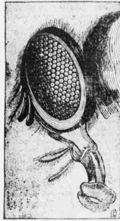
EYE OF A COMMON HOUSE FLY

The house fly, though it has infinite power of annoying us, has no teeth and not much mouth to speak of. It has a long proboscis or sucker. With that it absorbs liquids and fluids. It is fond of the oil and moisture found upon the human skin. That is why it keeps alighting on your nose and will not be driven away. There is always