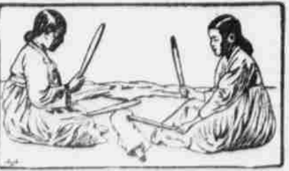
HOW TRUE IT IS IN KOREA.

During the recent war between Russia and Japan, which was begun by both countries trying to get possession of the little country of Korea, you heard a great deal about the Koreans. The illustration shows you the way