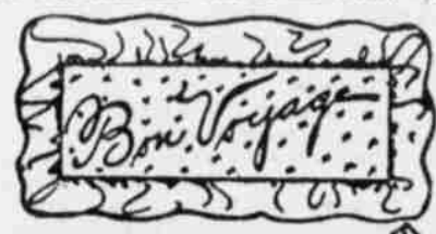
CUSHION FOR STEAMER CHAIR.

The regulation steamer cushion, with its familiar "Bon Voyage" inscription, has not lost prestige, but it is supplemented by a set of cushions connected by straps of self material and designed for the back and seat of the chair, with