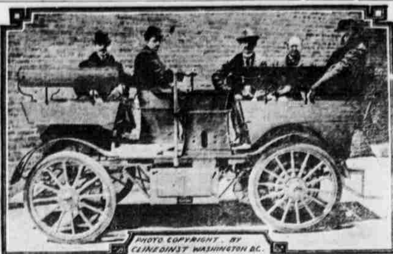
AUTOMOBILE USED BY SENATORS IN CAPITOL TUNNEL.

This is the first photograph ever taken of the automobile in use in the subway between the capitol and the senate office building in Washington. The vehicle is used by the senators and other officials and their clerks and secretaries in going from one of the buildings to the other and is a great time saver. The picture was taken when Vice President Sherman was taking his first ride through the tunnel.