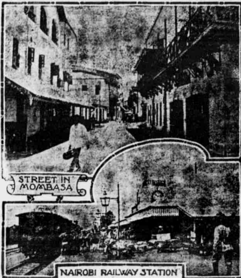
SCENES IN TOWNS WHERE ROOSEVELT HUNT STARTS.

An examination of the range where the sheep are known to have been poisoned will determine whether the plants are obtainable there or not, and a close observation of the sheep in feeding would also confirm the matter as to whether either of these plants have been the source of the difficulty. If we can assist in any way further in this matter I trust you will feel free to call upon us.