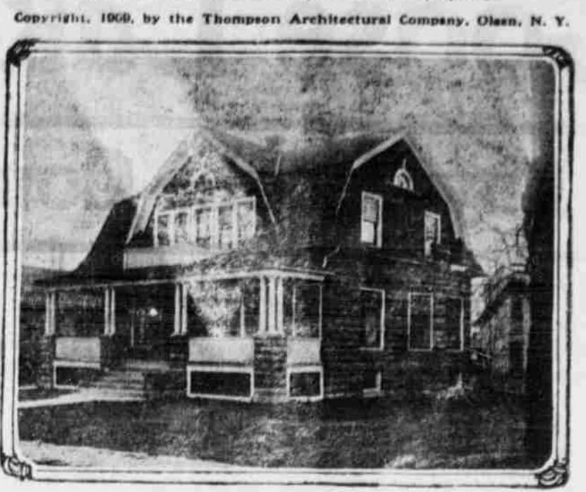
PERSPECTIVE VIEW—FROM A PHOTOGRAPH.

The Finish Gives the Appearance of Brown Sandstone. Architect's Estimate, at Least $5,000.