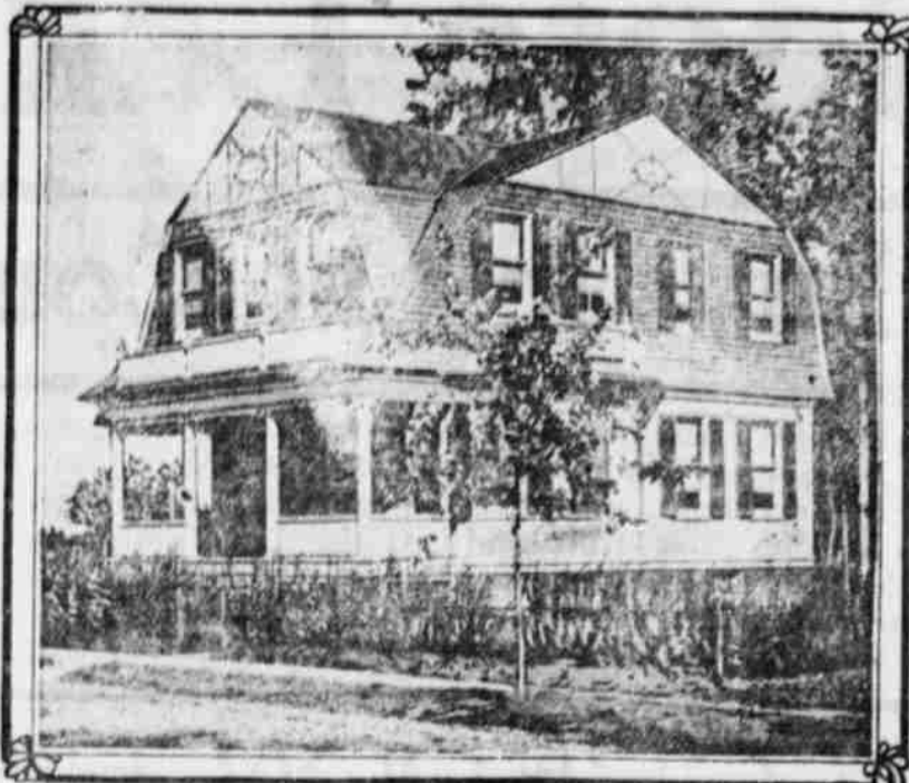
PERSPECTIVE VIEW—FROM A PHOTOGRAPH.