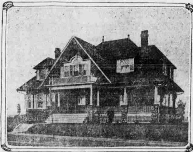
PERSPECTIVE VIEW—FROM A PHOTOGRAPH.