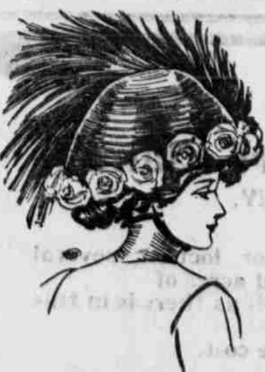
UGLY, BUT SMART.

In the millinery openings the hat shown in the sketch has a dominant place. That it is ugly no one doubts. That it is fashionable every one accepts. This one is of ecrú straw, rather loosely plaited and open. It is lined with pink silk, as it is quite the fashion.