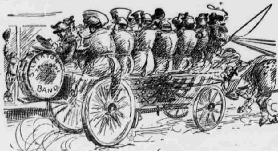
Silverton Trombone Band. "We always played as we drove out of town and with much effort the driver held the team"