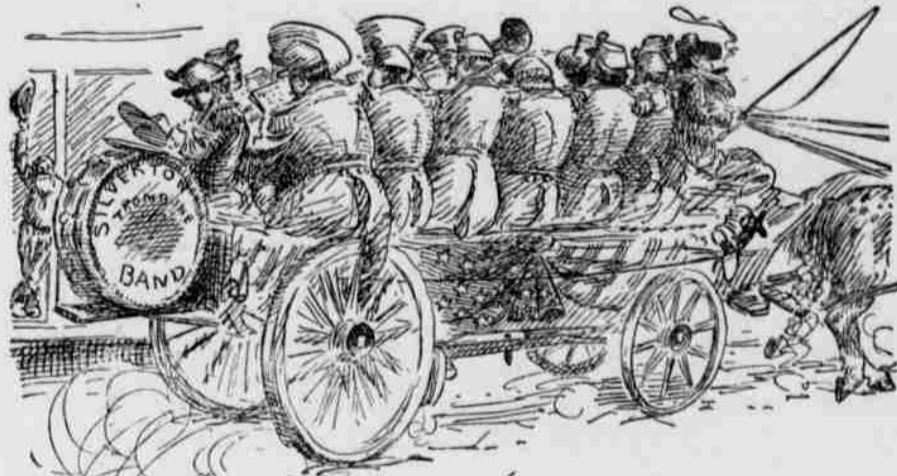
Silverton Trombone Band. "We always played as we drove out of town and with much effort the driver held the team"