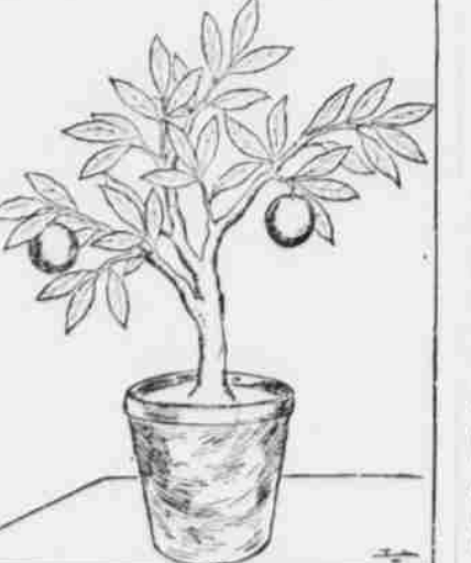
DWARF PEACH TREE.

The fruits we pet and pauper most are the peach and the grape. The ma- jority of peaches grown in this coun- try would seem to a Frenchman to be distinctly of the second order—that is, in the language of his fruit culture, a peach 'de plain vent,' or one grown on trees in an orchard. Between peaches grown thus, 'open to the wind,' and those trained on trellises against walls the French make a sharp distinction.