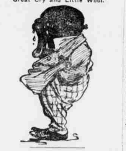
Were All Out.

The Cautious Reporter. "Young man," said the editor to the new reporter, "you lack caution. You naïveté learn never to state a thing as a fact until it has been proved a fact. You are apt to get us into libel suits. Do not say, 'The cashier stole the funds.' Say, 'The cashier who is al- leged to have stolen the funds.' That's all. Oh, get something about that First ward social tonight." The next day halfway down the so- cial column the editor saw the follow- ing cautious paragraph: "It is rumored that a card party was given last evening to a number of re- puted ladies of the First ward. Mrs. Smith, gossip says, was the hostess, and the festivities are reported to have continued until 11:20 in the evening. The alleged hostess is believed to be the wife of John Smith, the so called 'high priced grocer.'"—Success Maga- zine.