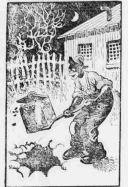
"HE SAW HIMSELF DIGGING UP A CHEST OF GOLD IN THE BACK YARD."