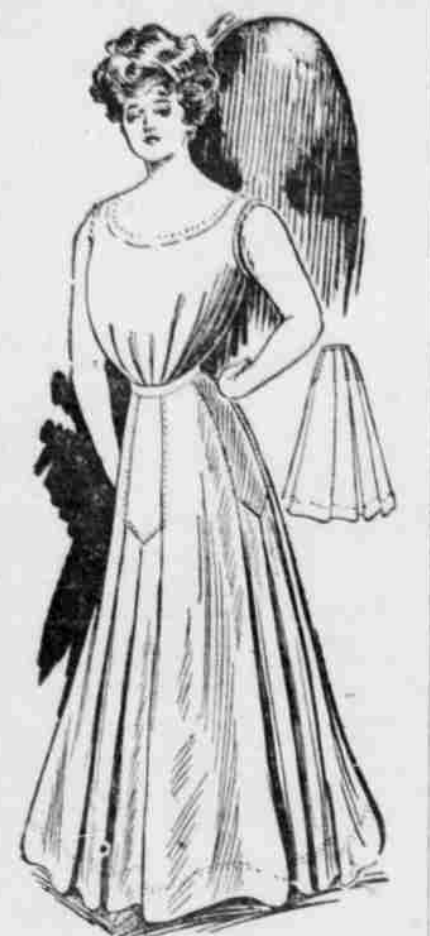
SHEATH SHAPED SKIRT—3255. A pattern of this sheath shaped skirt may be had in six sizes—from 22 to 32 inches waist measure. Send 10 cents to this office, giving number (3255), and the pattern will be promptly forwarded to you by mail.

The Waist of 1908 is Very Small. Dull Jet Trimmings Chic. The waist of 1908 is growing very small. Corsets are worn fully two sizes smaller than they were formerly, and everything points to the return of the little round waist. A corsetiere who makes corsets for many professional beauties has this to say about the new round waist: "The call for the small corset may be due to the fact that there are fewer fat women than there used to be. The craze to lose flesh is so great that the fat woman has almost disappeared from the face of the earth."