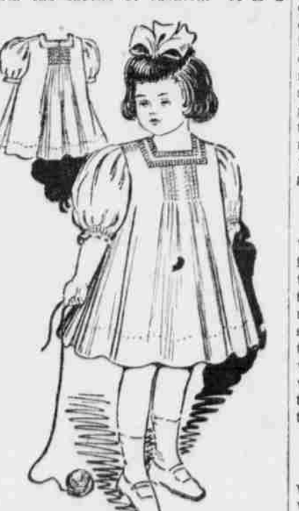
CHILD'S SIMPLE DRESS—3115. A pattern of this pretty dress is cut in three sizes—for one, three and five years of age. Send 10 cents to this office, giving number (3115), and the pattern will be promptly forwarded to you by mail.

Fashionable Demiseason Colors. Darned Net Blouses Modish. Topaz brown, a cold gray blue and a peacock green are newer than the purple tones, which in the earlier part of the season were almost done to death. White net blouses with a large mesh darned in white or colored silks in a splashing design are smart. These blouses are made up over chiffon to soften them. An incontrovertible edict has issued from the throne of fashion. It is a