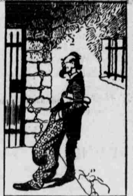
"I WAS IN JAIL FOR LICKING THE LIGHTNING ROD MAN."

No one within sound of my voice will dispute the fact that a new era