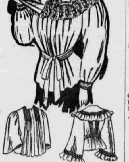
A DAINY NEGLIGEE—2634. A pattern of this simple negligee may be had in six sizes—32 to 42 inches bust measure. Send 10 cents to this office, giving number 2634, and it will be promptly forwarded to you by mail.

Tighter Bust Line and Closer Fitting Skirts in Vogue—Hippies Effects. The newer gowns and waists show a tighter bust line than in many years, and, as all skirts are fitted closely over the hips, underwear must be selected which will assist in securing a sheathlike or, as it is called, a hipless dress skirt. Black velvet coats are seen with moire waistcoats and striped black and blue or mole or dull violet skirts. The newest sleeves for tailored frocks are arranged in deep tucks and cut in one with the coat or bodice. Some of the smartest bows for wear with tailored shirt waists are made of wide, soft shaded ribbon tied in a small looped effect at the top, from which hang knotted ends about five inches long. The negligee illustrated is very dainty if carried out in pale blue or pink albatross with wide bordering bands and collar of white wash silk, with wafer dots of black. Wide silk braids and frogs are effectively used for closing the negligee. One sees, too, hand worked buttonholing in self color finishing collar and cuff edges on these robes, and occasionally heavy raised embroidery designs are worked directly on the cloth. JUDIC CHOLLET.